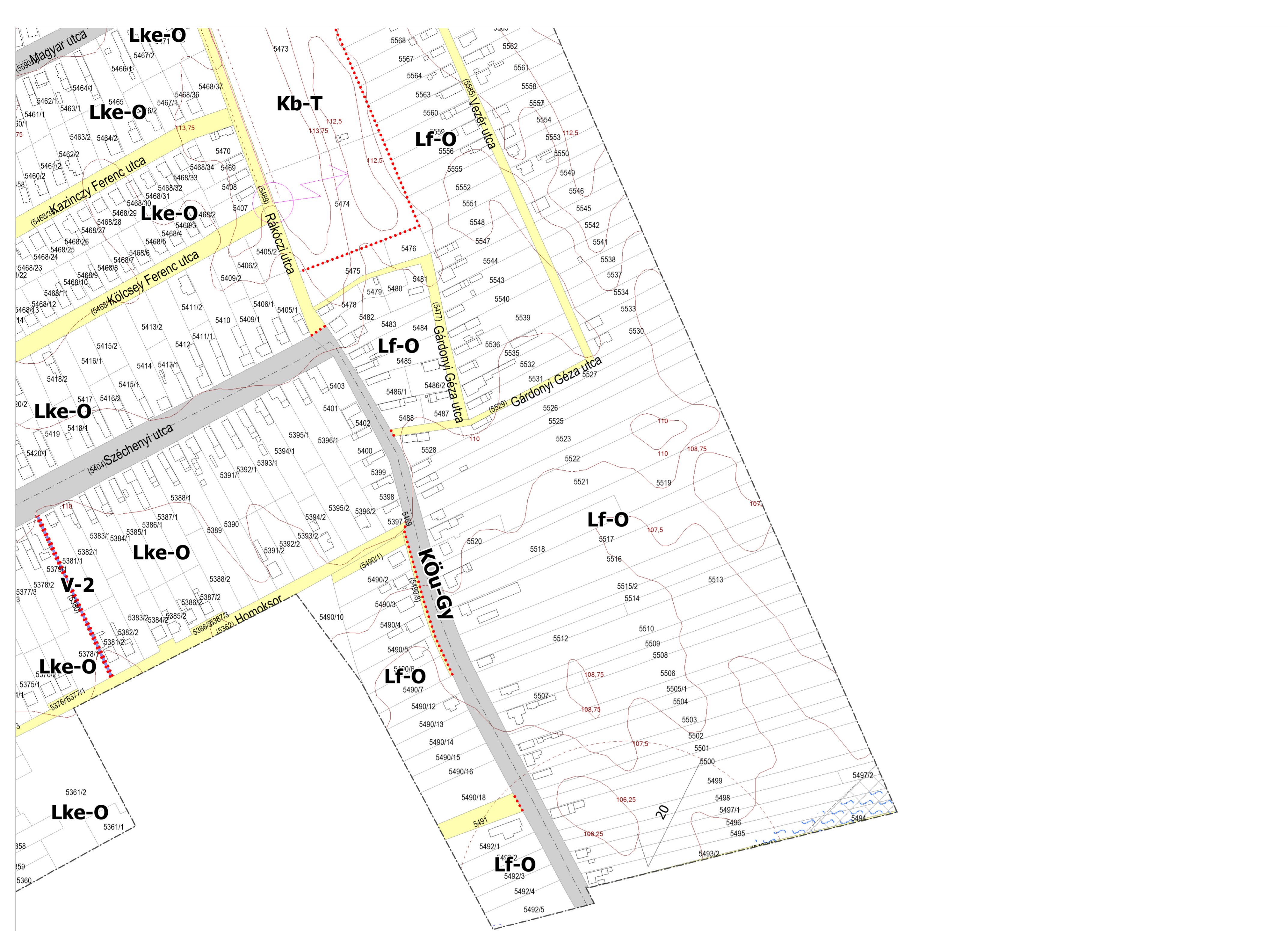
HÉSZ 2. SZÁMÚ MELLÉKLET